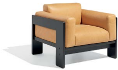
Lounge Chair 34"W x 30¾"D x 27½"H