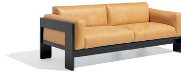
Three-Seat Sofa 86¾"W x 34¾"D x 30"H